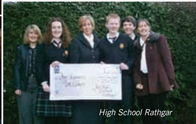
High School Rathgar