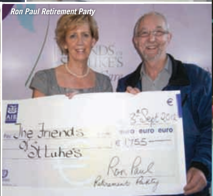
Ron Paul Retirement Party