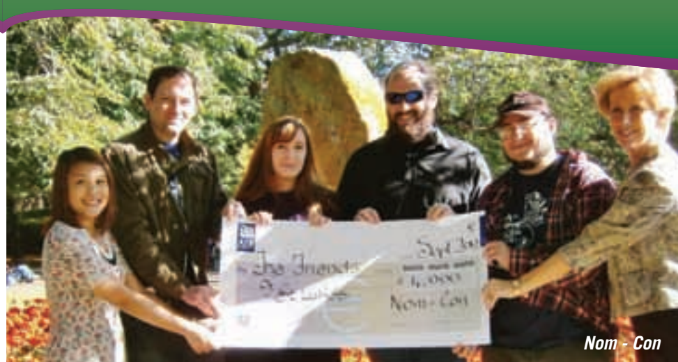
Nom - Con