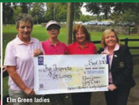
Elm Green ladies