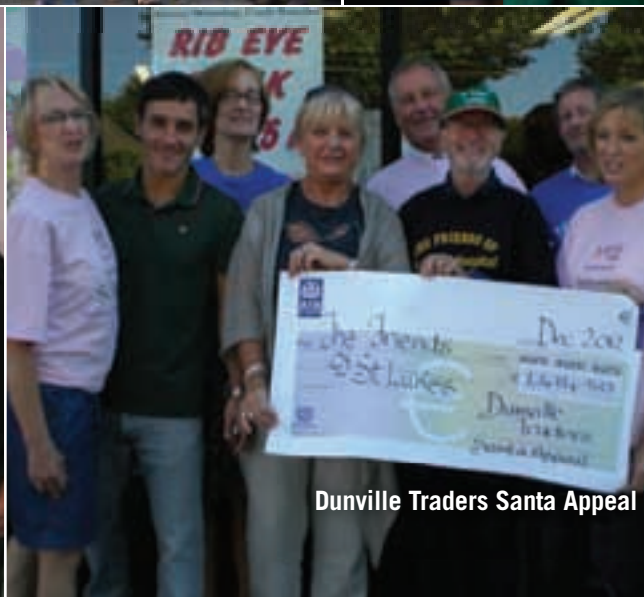
Dunville Traders Santa Appeal