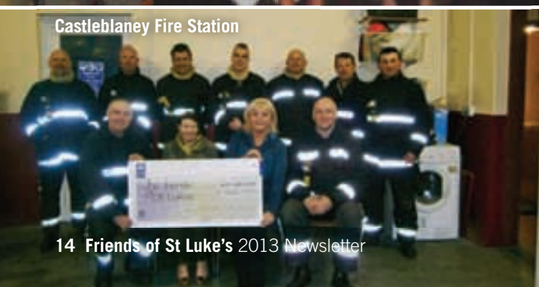
Castleblaney Fire Station