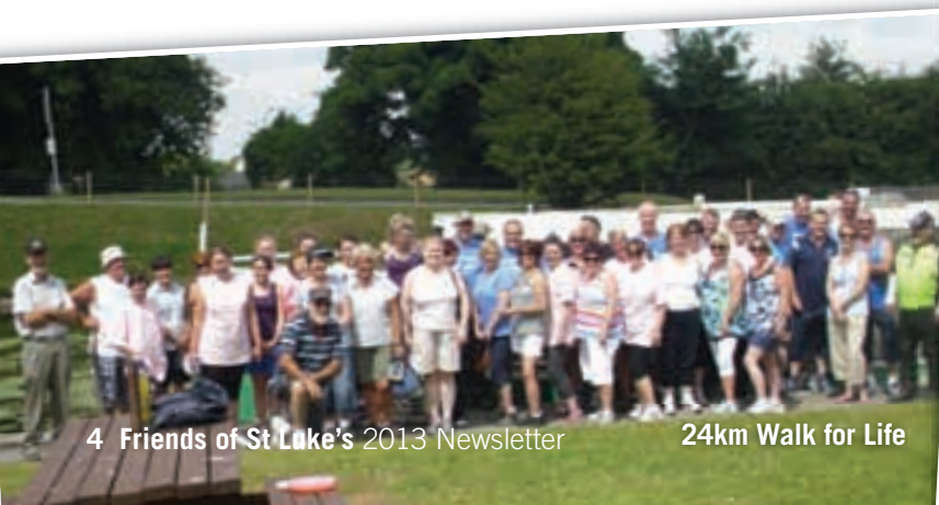
4 Friends of St Luke's 2013 Newsletter