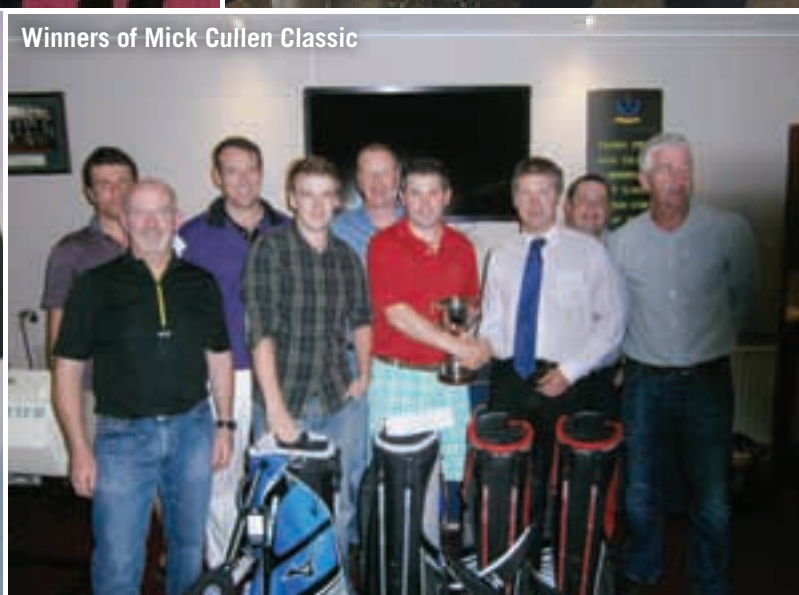
Winners of Mick Cullen Classic