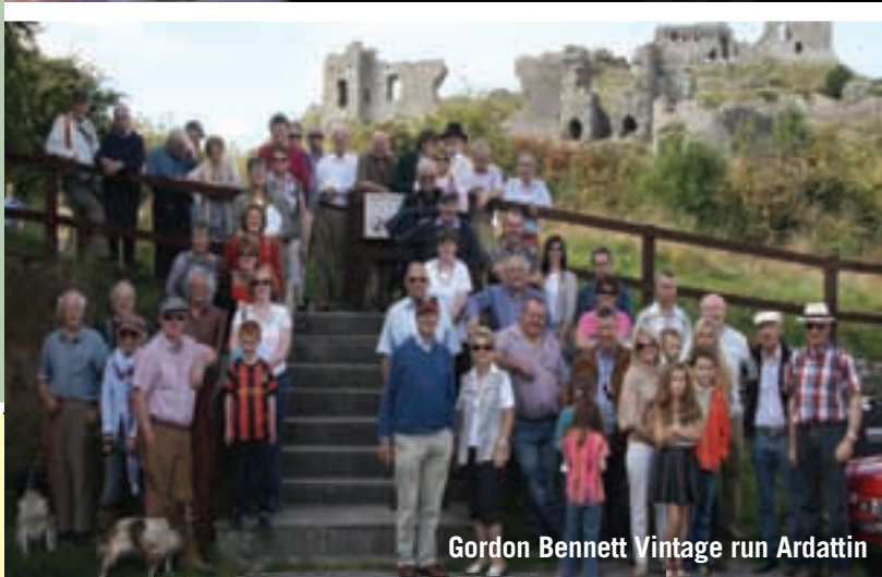
Gordon Bennett Vintage run Ardattin