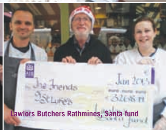
Lawlors Butchers Rathmines, Santa fund