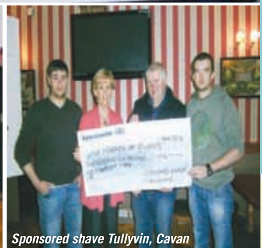
Sponsored shave Tullyvin, Cavan