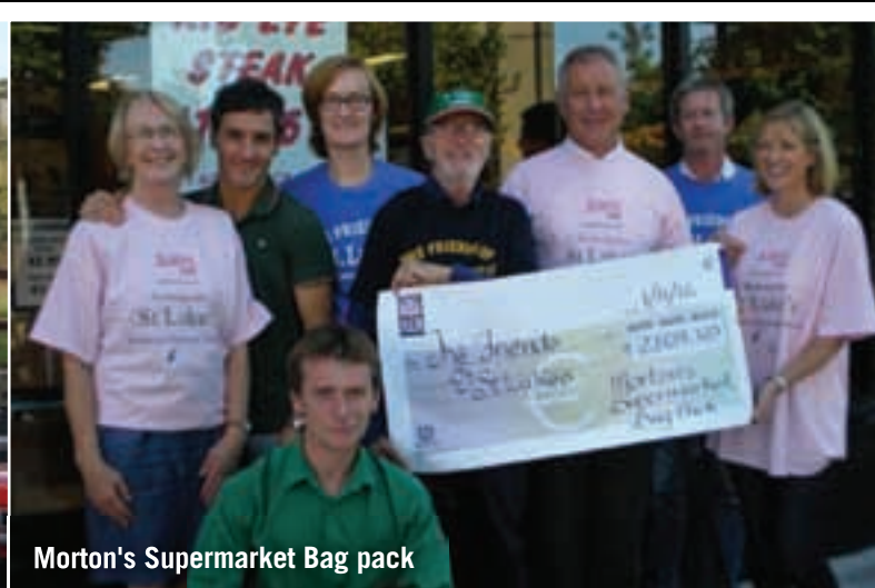
Morton's Supermarket Bag pack