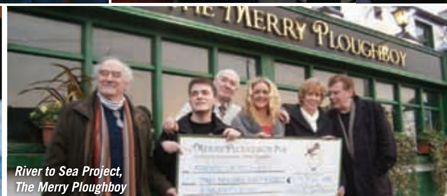
River to Sea Project, The Merry Ploughboy