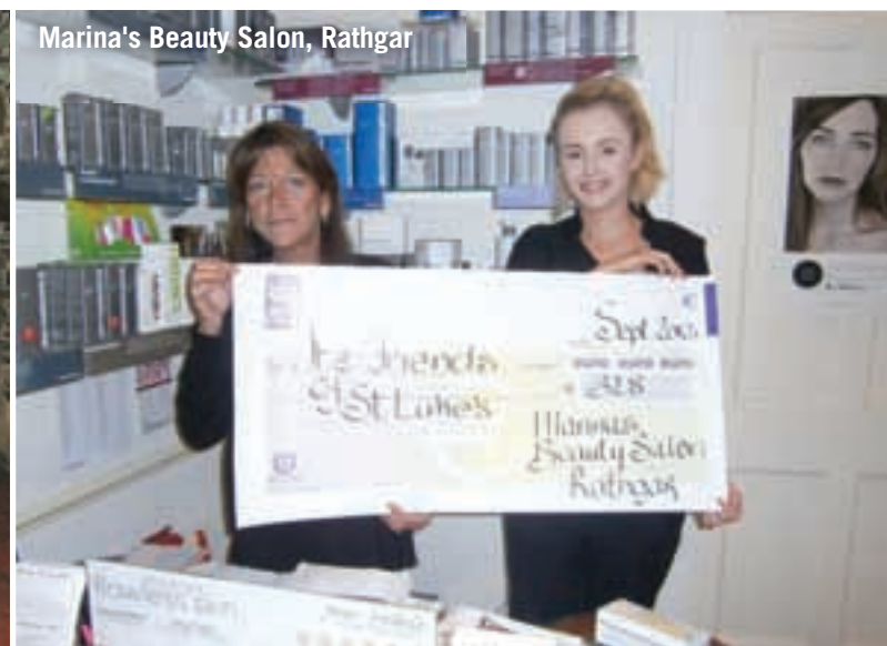
Marina's Beauty Salon, Rathgar