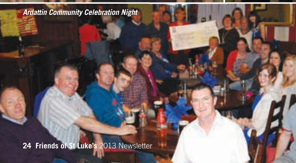
Ardattin Community Celebration Night