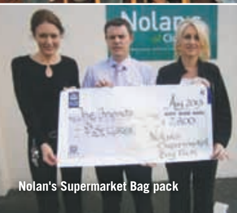
Nolan's Supermarket Bag pack