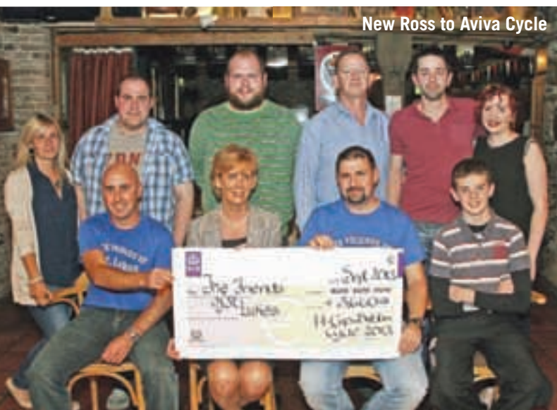
New Ross to Aviva Cycle