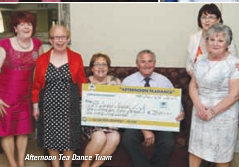
Afternoon Tea Dance Tuam