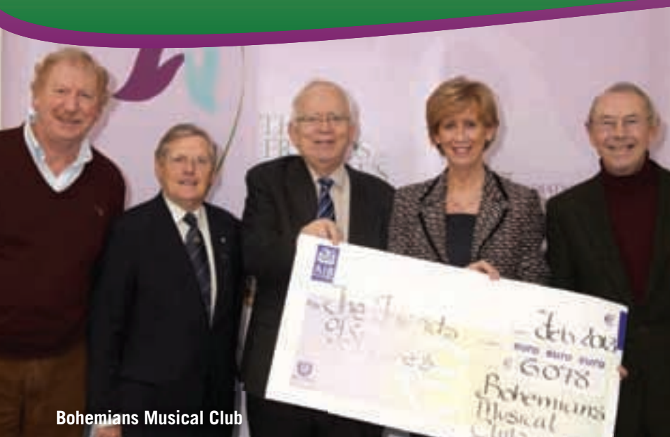
Bohemians Musical Club