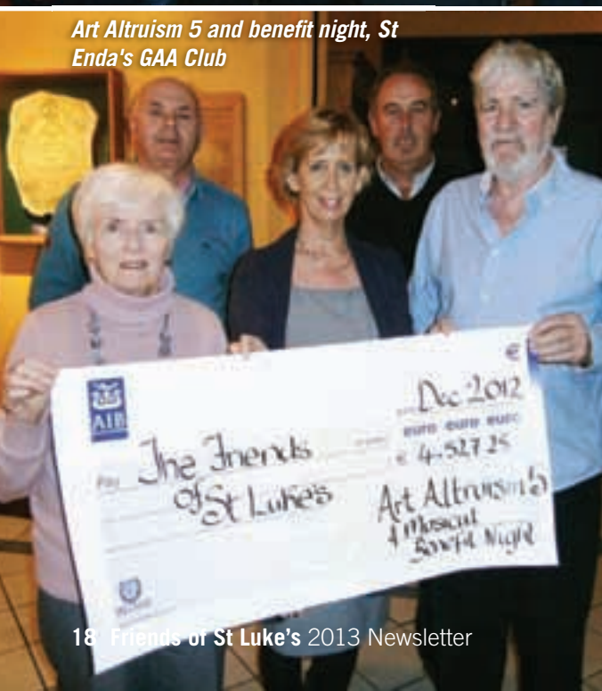
Art Altruism 5 and benefit night, St Enda's GAA Club